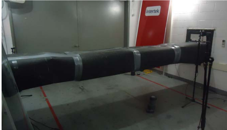
View of Test Setup (Lagged)