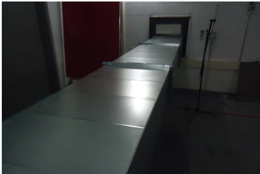
View of Test Setup (Bare)