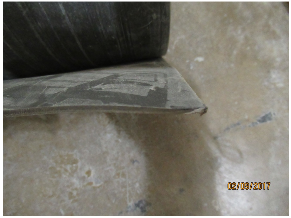
Figure 2 – Detail of the test specimen.