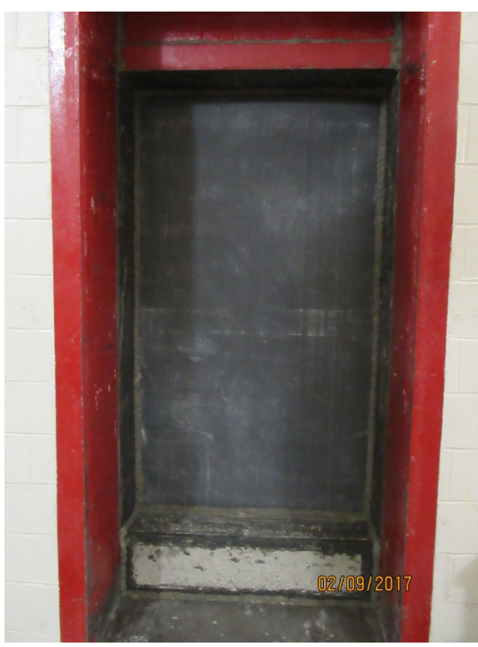
Figure 1 – Specimen mounted in the test opening.